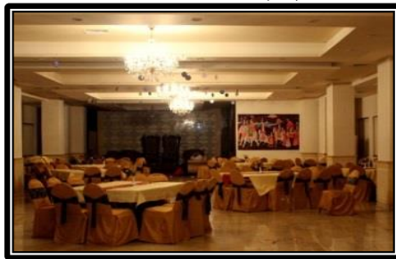
Figure 2 New Planned Traditional Lighting (TL) in Jasmine Restaurant (R2)

The data for the number of patrons coming to the restaurants, was collected in the month of August 2013 for previous lighting (L1) then in the starting of September 2013 new planned lighting was implemented in both of the restaurants and after 22 days of new lighting the survey was again conducted in October 2013 in new planned (L2) lighting (CL and TL) in Lahore View restaurant (R1) and Jasmine Restaurant (R2). The record of number of patrons coming to the restaurants, from 7pm to 10 pm, was maintained in an Excel sheet. Then the data was calculated by the use of a formula to calculate the rate of patrons' turn over in the restaurants. The formula deals with the seating capacity in each restaurant and the patrons coming to the restaurant. According to the formula, total numbers of patrons seated (dined) in the restaurant were divided by the total number of seats available in the restaurant, the formula is given below in figure 3.