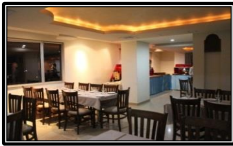
Figure 1 New Planned Contemporary Lighting (CL) in Lahore View Restaurant (R1)